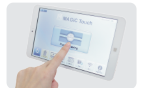
Wireless control with tablet