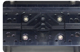
A vise for easy fastening of various shapes/sizes